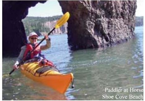
Paddler at Horse Shoe Cove Beach

Located in Advocate is Cape Chignecto - Nova Scotia's largest Provincial Park and a hiker's paradise. Here you can walk the beach or hike along cliff tops for spectacular views 600ft above the Bay of Fundy. The park offers 29 km (18 miles) of predominately coastal hiking trails, along with 51 backcountry hike-in campsites, 37 walk-in campsites, wilderness cabin and bunkhouse, picnic area, interpretive centre with gift shop and accessible washrooms. Opening in 2008, the Eatonville day-use park will feature accessible walking trails suitable for